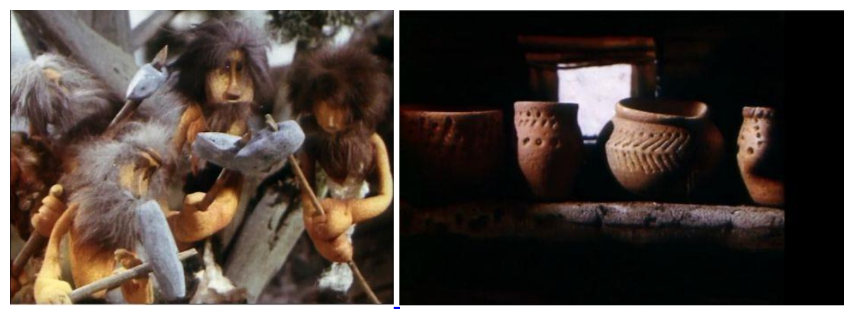
Figure 1: Frames from the animation "Välek Vibulane" (<u>Tallinnfilm 1980</u>). The stone axes with a bored hole depicted on the first frame came to use on the territory of Estonia together with the Battle Axe and Corded Ware culture (Johanson 2006, 100–101) about 3000 BC (Kriiska 2000, 75). On the other frame one can see pots decorated with comb impressions and pits and dimples, these pots had conical (not flat) bottom in Estonia; the first vessels with a flat bottom came with Corded Ware, but their ornamentation is dominated by cord impressions, notches, grooves (Kriiska 2000, 64–70).

During my 15 years of work in heritage management, I have constantly held discussions with owners, developers, people from municipalities, and state institutions, who manage land where archaeological heritage is situated (Kadakas and Lillak 2019, 52). Together with my colleagues from the National Heritage Board, I explain daily the significance of archaeological heritage, values of preservation, and the necessity of study before the excavation. Often the owners raise questions: why is it necessary to do the fieldwork; what benefit can be expected from the excavation of these specific settlement layers; or from studying inhumation burials from the Christian period? Given the context of the personal example presented at the beginning of this article and the discussions in my everyday work, there is a reason to ask: how quickly should public benefit of archaeology appear and how quickly in fact does it appear, if at all?