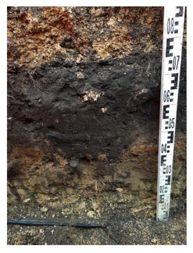
Figure 3: A supposed fireplace from 10th-17th c. in a settlement site of Viira on the island of Muhu. The stratigraphy of the soil layers cannot be understood without learning archaeology.

Many field studies take place on sites where there is almost no archaeological material that the wider public would recognise. Until the 13th century the building traditions of Estonia did not include lime mortar, with timber, thatch, straw, clay and dry wall used at this time. Very early horizontal beam structures started to dominate, which leave almost no traces in the soil compared with post constructions. Therefore, the traces of prehistoric settlement are very faint in the landscape. Only artefacts, burned stones, working and food remains mark the cultural layer and, when lucky, one can find traces of a fireplace (Figure 3) or 3-4 stones that mark a house foundation. Many villages of Estonia have been situated in the same place for at least 1000 years. Therefore, the earlier settlement structures are often disturbed by later ploughing or construction work. Often only a few sherds of pottery relate to settlement of the Bronze or Early Iron Age within a later settlement site. If the salvage archaeologist is not able to distinguish the Early Metal Age artefacts, he or she will obviously not notice their potential. Often a single sherd of pottery is not diagnostic, and only a synthesised study can tell us whether we have a settlement pattern of single farmsteads or villages, or if there are any peculiarities of coastal and inland settlements etc.