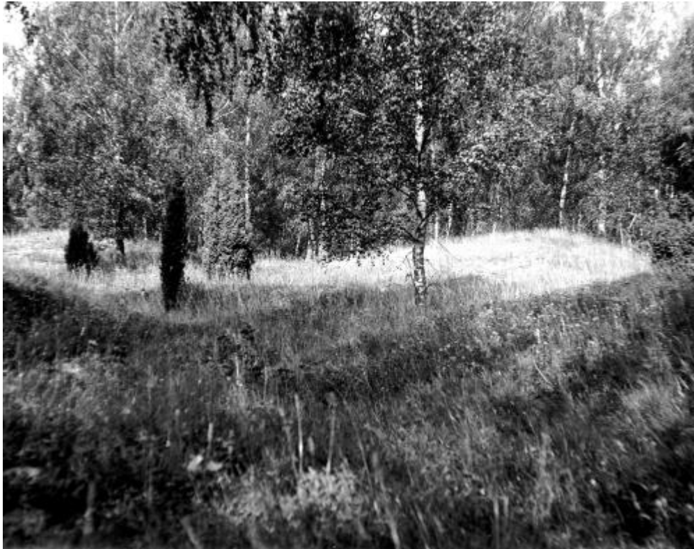
Figure 6: Hemlanden 1931. Before the restoration of the Hemlanden