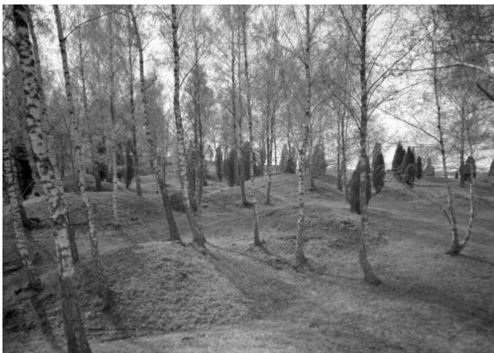
Figure 9: Hemlanden 1946

After several years of working against the wind, the criticism turned to cheers and applause. It took just over 10 years of restoration work to return the pastures and meadows to their former appearance. Only then could the annual maintenance work of clearing and grazing be introduced - work that is still carried out at Birka today. That the work has been successful speaks volumes for the large number of visitors who come to the island annually. In 1950, Björkö was visited by about 20,000 people, in 1973 by 50,000, and before the pandemic in 2019, about 80,000 visitors came to the island.