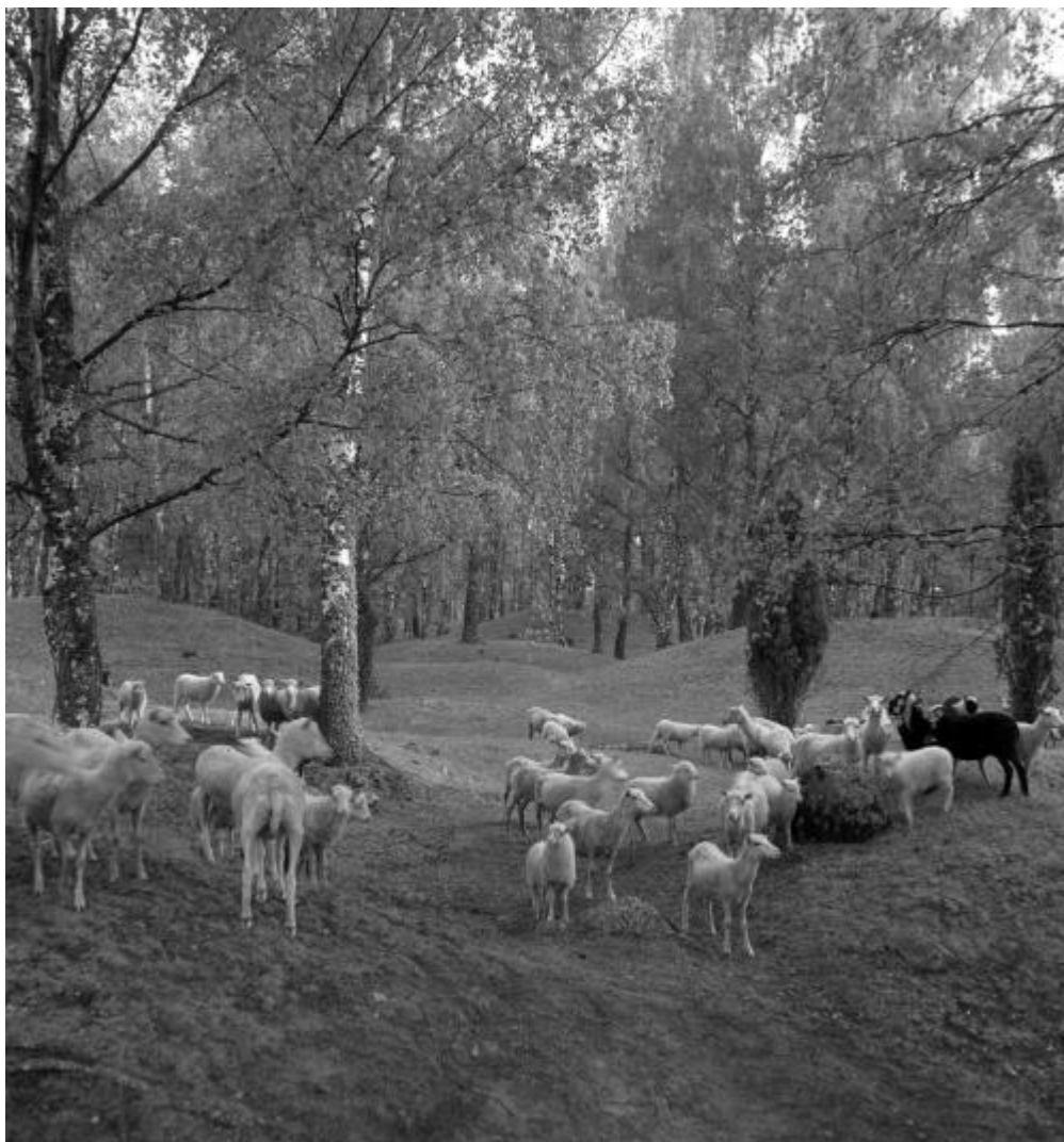
Figure 8: Hemlanden in the 1940s. A day at work for Birka's sheep