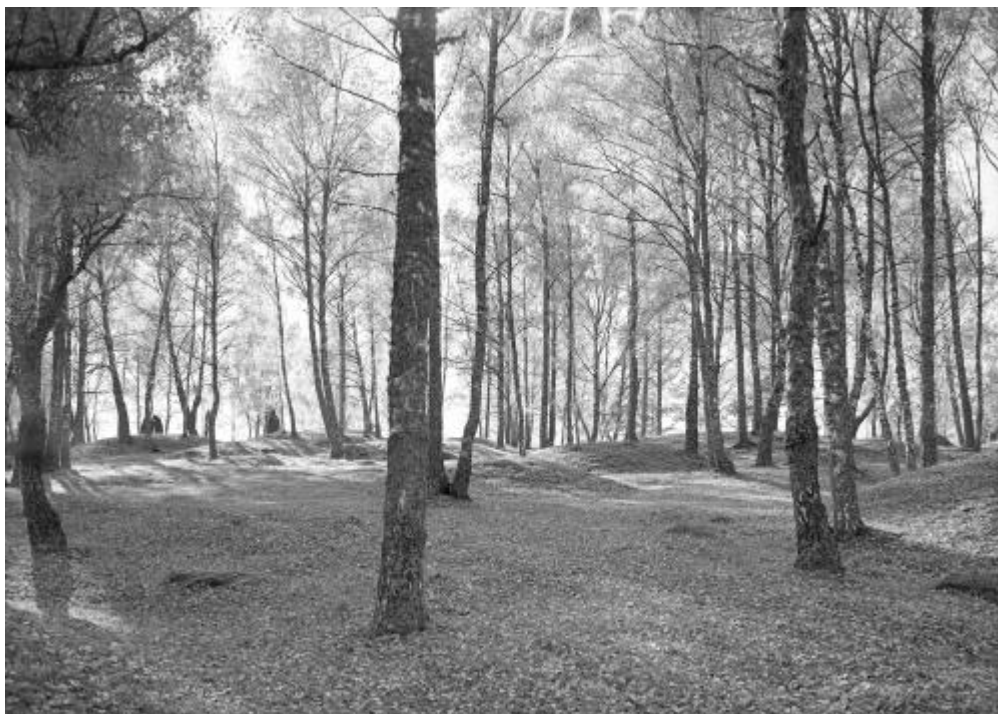
Figure 7: Hemlanden 1939. The restoration of Hemlanden almost complete. After 1940, annual maintenance begins. The annual maintenance consists of grazing and clearing of bushes etc.

In 1938, a reputable antiquities association visited Björkö. The aim was to extend and expand the ban. Instead, however, they were impressed by the other restoration of the landscape - not least the work at the Hemlanden burial ground (Figures 7-9). During the 1940s and 1950s, representatives from, among others, the Swedish Nature Conservation Association and the Forestry Agency visited Björkö to study the restoration work (Gustawsson 1977 , 99).