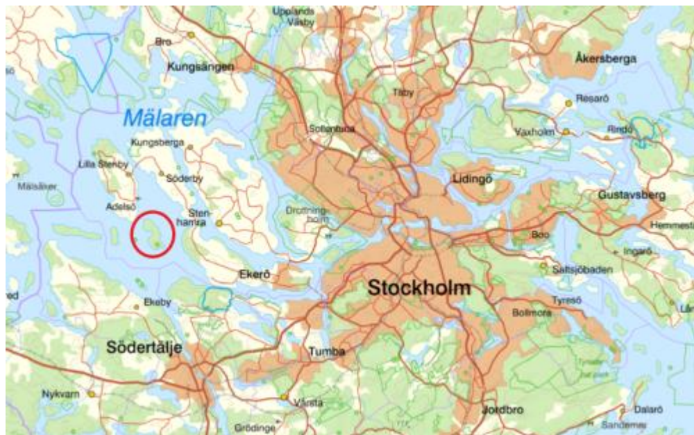
Figure 1: The island of Björkö, located in Lake Mälaren

The island in Mälaren that Hjalmar Stolpe came to visit was Björkö (Figure 1). Since the 17th century, historians have considered that the place mentioned as Birka in Rimbert's Vita Ansgarii is located on Björkö (see Odelman 1986 ). The director of what would later become the Swedish National Archives, Johannes Messenius, wrote in 1612 that 'every youngster in Sweden knows that Birka was on Björkö' (Ambrosiani 2013 , 8). The first excavations, in which National Antiquarian Johan Hadorph participated, were carried out as early as 1680.