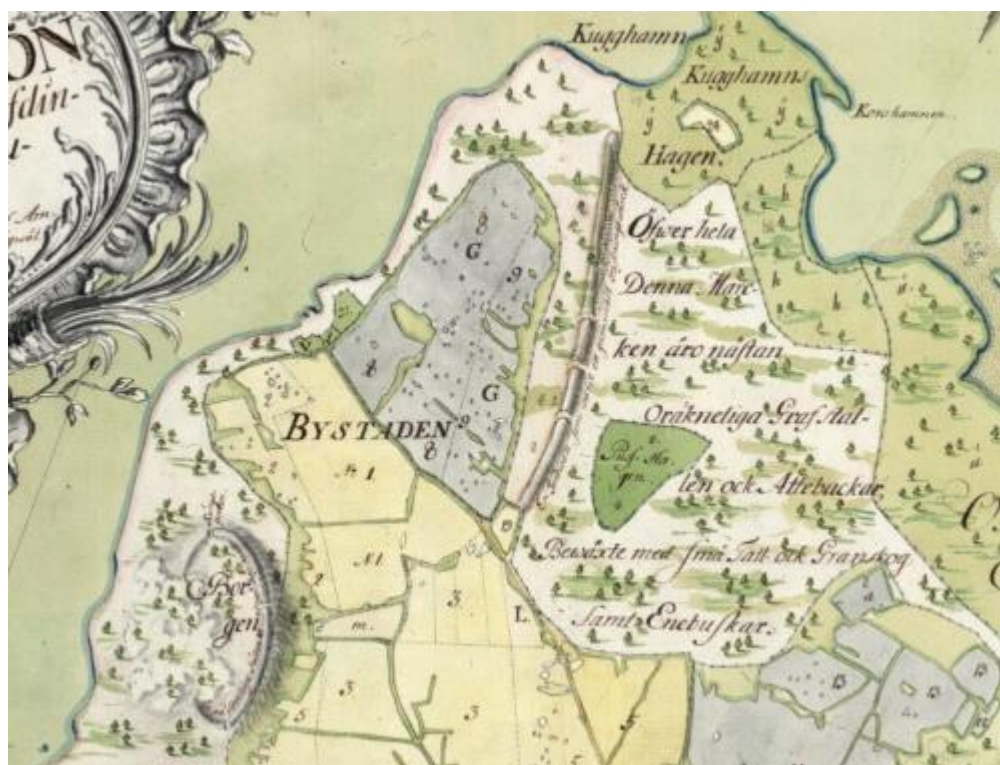
Figure 4: A part of the map of Björkö from 1747. On the part of the map where most of the graves are located is written: 'Here are almost innumerable graves and ancestral hills. Small pines and spruces and juniper bushes grow here'. The map also shows that the area with

Before the plans to carry out this land reform, the farmers on Björkö began to cut down the small amount of forest that was on the island. On a map from 1747, it appears that the small forest that grew on the island was barely enough for fencing material. The map descriptions state that there is fine birch forest on the island. According to a travelogue from 1811, however, there was no birch on Björkö (literally the birch island) (Figure. 4). There were also plans to sell off land within the Black Earth and on the large adjacent burial ground Hemlanden in order to construct holiday homes. This led to the question of whether Björkö should be bought by the state in order to preserve the ancient remains. There were plans for the state to buy the whole of Björkö, but as several landowners did not want to sell, only the northern part of the island came up for sale. After a parliamentary decision in 1912, the state bought the northern part of Björkö, the area where most of the ancient monuments are concentrated (Gustawsson 1977 , 87).