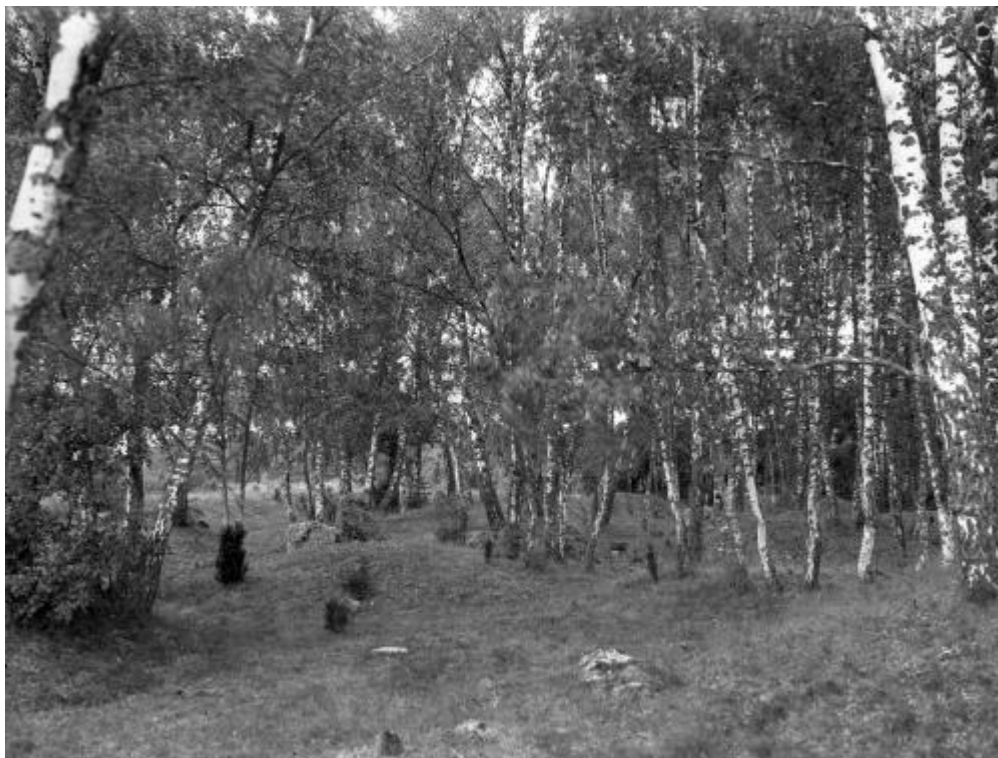
Figure 5: Hemlanden 1912, overgrowth

This was the first time the state had purchased an area of ancient remains where previously only nature conservation areas had been purchased. The reason why all traditional management was prohibited on the purchased land was due to Sweden's first nature conservation law from 1909. As a result of this law, the first national parks in Sweden were also established on state-owned land at that time. These areas were then left for 'free development' or 'non-intervention management'. The idea was that the land areas should be left undisturbed and exhibit nature untouched by humans. The same thoughts came to apply to Birka. Not a tree was to be cut down, not a branch was to be broken. Wild vegetation was thought to be characteristic of the ancient landscape. The first decision after the state bought the area was to prohibit the area from being grazed. Land that had been pasture for hundreds of years was left for overgrowth (Gustawsson 1977 , 91). The overgrowth happened quickly (Figures 5 and 6), and the ancient monuments were damaged by this. The antiquarian authorities complained, but no one listened.