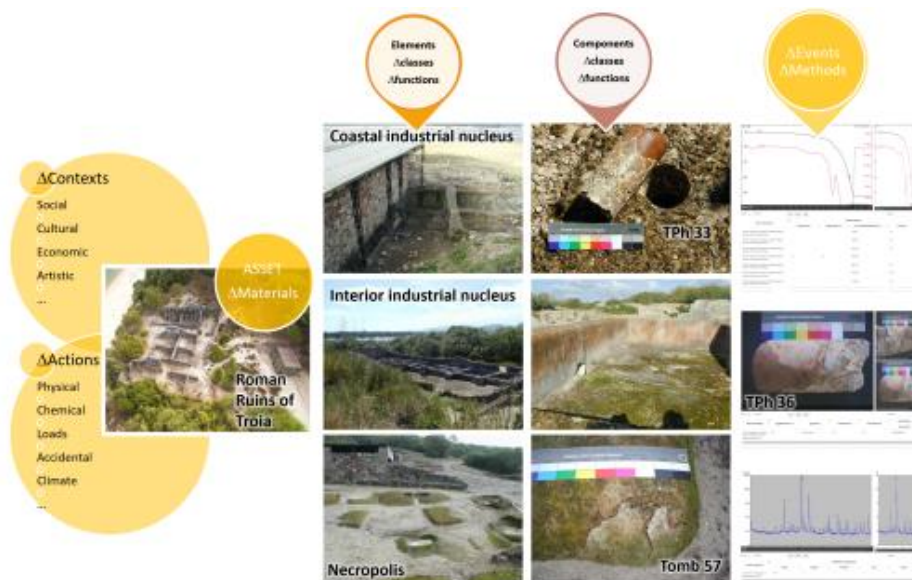
Figure 5: Roman archaeological site of Tróia. Outline of data systematisation illustrated with examples taken from an inspection event (see http://dbheritage.lnec.pt/dbheritage/historicaldata#/event/55/str/1810 )

For example, the Tróia archaeological site comprises various structures in distinct places with different elements and constituents produced for diverse purposes. Through time the surrounding contexts and actions on the asset have changed. Additionally, it has also been affected by different human-made events. The respective data systematisation and integration, as illustrated and outlined in Figures 5 and 6, is therefore essential for a comprehensive interpretation of the asset performance.