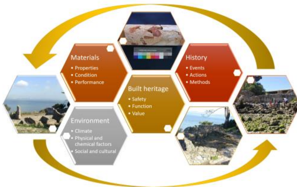
Figure 2: Simplified schema of DB-HERITAGE model with illustrating figures from the Roman archaeological site of Tróia

Building materials data are specifically systematised by type and function, addressing the primary technical and historical subject matters on materials and construction practices. Thus, the materials are linked to their provenance, which is hierarchically displayed and detailed, including information on the evolution of built assets and of their components in both space and time, and according to their functions and use contexts.