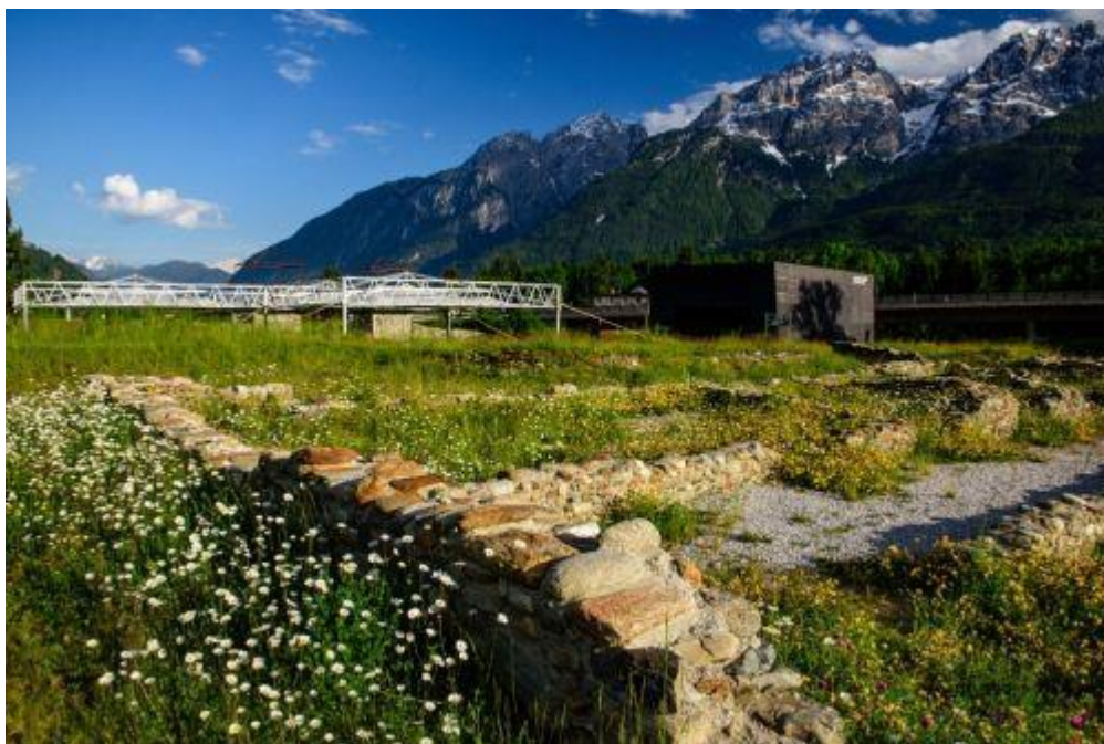
Figure 3: New vegetation and restored walls at Aguntum

Every summer, restoration and conservation work takes place in Aguntum. The work is done according to urgency, schedule and the results of a prospection done in 2014. Acute damage also has to be remedied where, for example walls and buildings restored many years ago are in danger of collapse owing to the effects of weather. New and innovative ways to conserve these elements had to be developed while also giving visitors an idea of the dimensions of the buildings. Several ways were tested and implemented, but they all follow the same strategy - to protect the important archaeological features with soil and reproduce the layout with new low walls, hedges or small hills.