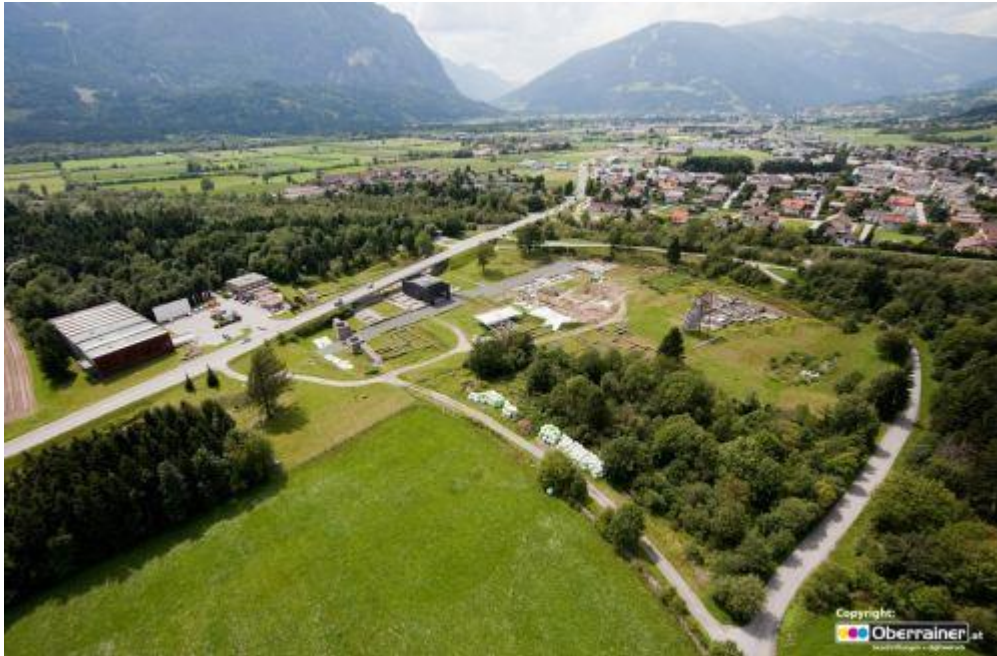
Figure 1: Aerial overview of the Roman town and Landscape Park of Aguntum

Around ten years ago, the archaeological site of Aguntum was not attractive to visitors, had an inconsistent appearance, and no clear policy for future development. A broad-based process to define a mission statement for Aguntum was initiated in 2014, in cooperation with the Tyrolean company 'REVITAL Integrative Environmental Planning', the association 'Curatorium pro Agunto' and other institutions like the Federal Monuments Authority Austria. The goal was to create a common, homogeneous strategy that would serve as a future 'big picture' for all decision-makers to orientate themselves by.