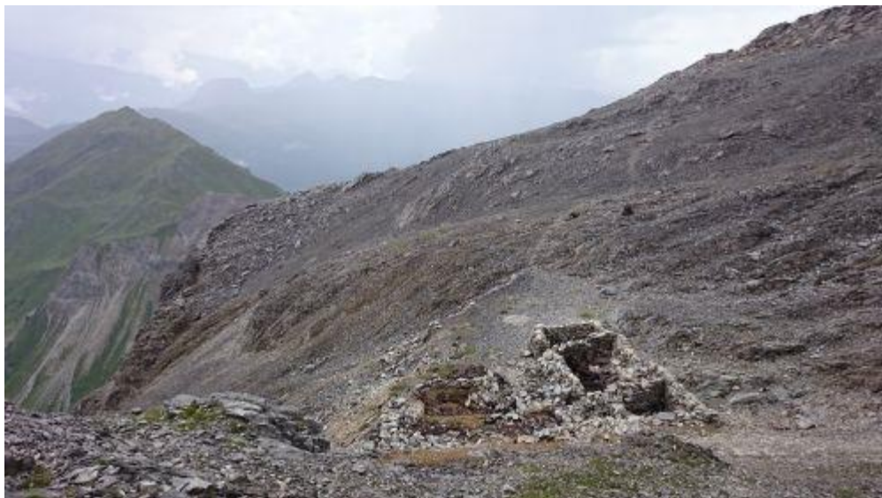
Figure 2: Carnic Crest Kartitsch Hohe Kinigart

Some examples of the almost 900 individual objects recorded include posts, buildings, a cable car, and cemetery. Objects are in very different conditions; many small finds were on the surface right along the hiking paths and in the collapsed building sites. For a few objects, a historical identification was possible through historic photographs (Figure 2).