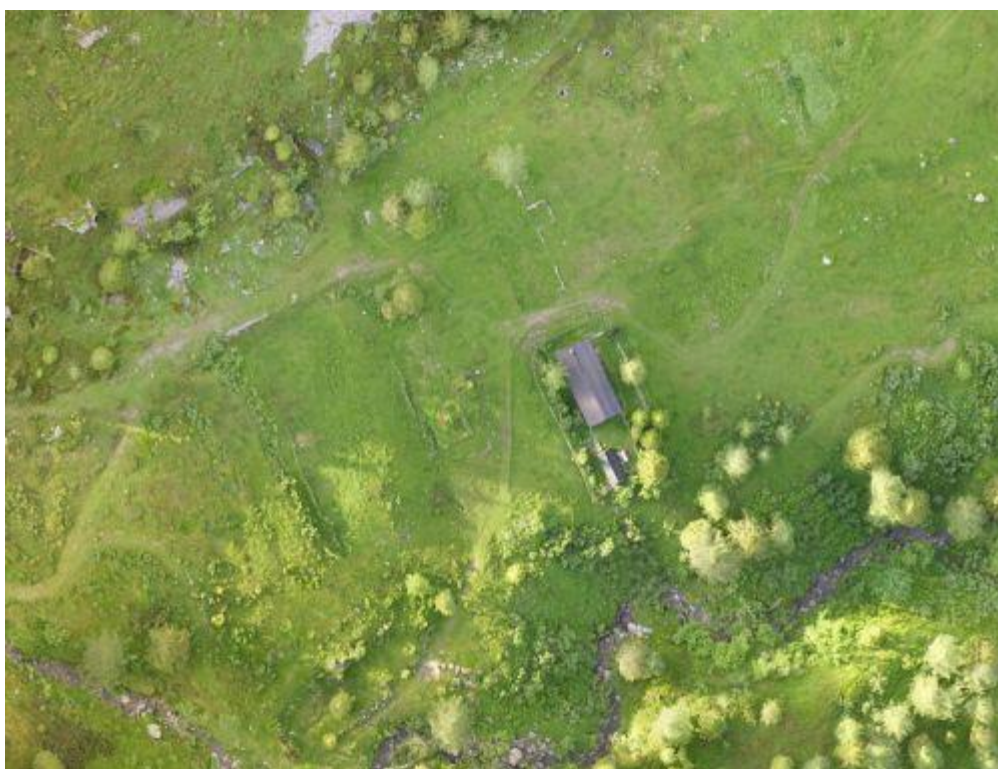
Figure 3: Rattendorfer Alm, Barracks detail

The historical photograph allows us to identify the structure as a second barracks for the troops (Figure 3). Some of the better-preserved structures still have walls, windows and doors intact. As during the research in Tyrol, we also found wooden beams, wooden flooring, wooden inner wall structures and many small finds still lying on the site surface.