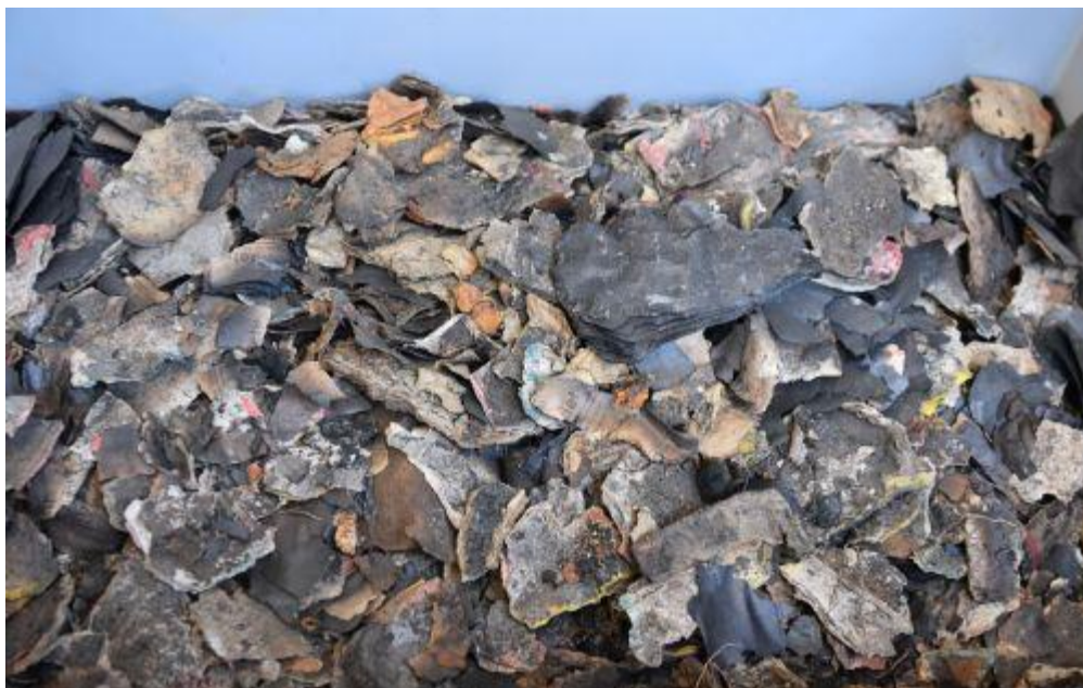
Figure 4: NS Papers, Graz

During the development of a hydroelectric power station in Graz Liebenau, the remains of a forced labour camp that was 'Aussenlager' to Mauthausen and a station of the Death Marches of April 1945 brought its own problems. The question of mass graves in the area is still unanswered, but needs to be addressed with stakeholders and the public. All finds from both sites were sorted and then stored in groups. In a second process, a few well-preserved or otherwise remarkable items in each category were defined and brought into museum storage where the evaluation and interpretation process are underway.