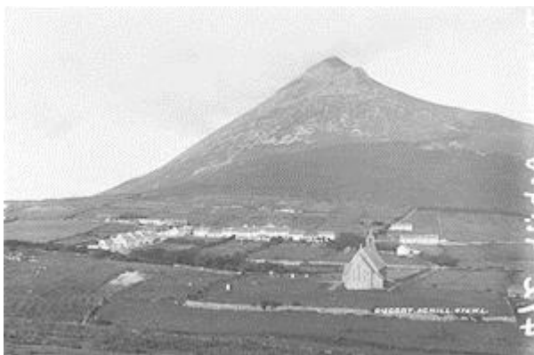
Figure 4: The Achill Mission at Dugort, between 1880 and 1900

The Herald provides decades of commentary on life on the island, though from a very specific geographic, cultural and political vantage.