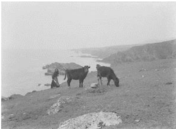
Figure 6: Woman driving cattle on Achill Island, c. 1900-1920

employment on Achill, seasonal migration provided one of the only alternatives to permanent emigration, a route chosen by many other Irish in the 18th, 19th and 20th centuries. Seasonal migration helped continue leased landholdings and was supported by communal practice at home; without households working together to care for livestock, tend crops and collect seaweed and turf, only a few households would have been able to send migrants abroad, limiting income to too few people to earn a village's rent. Though women also participated in large numbers in seasonal migration, the practice provided an opportunity for contemporary social critics to highlight their perceived problems with the active participation of women in nearly all of the household's and village's agricultural tasks, including the collection of seaweed and turf and driving and tending livestock (Figure 6).