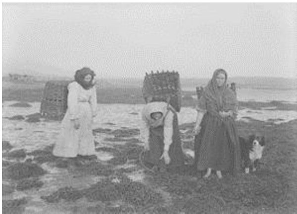
Figure 2: Three women with baskets gathering seaweed on the west coast of Ireland, c. 1900-1920.