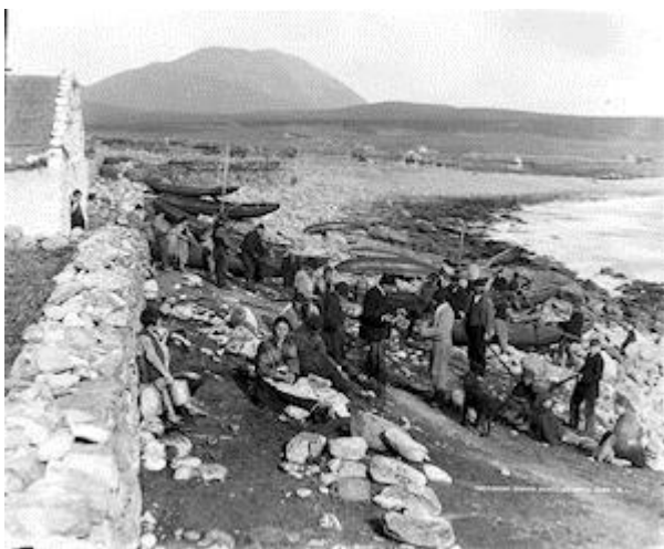
Figure 7: Curraghs and the fishing community at Dooagh village on Achill, c. 1890

In fact, it appears that a reliance on the sea may actually have increased in the late 19th and early 20th centuries, as seasonal migration from Achill became routine practice, expected of a certain portion of the population (Dunn 2008 ). Additionally, residents of Slievemore, situated inland in the north-western portion of the island, abandoned that village for Dooagh, situated directly on the southern coast of the western portion of the island.