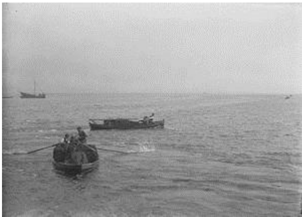
Figure 3: Foreground: two Achill yawls with cargos of turf. Background: a curragh is towed by a Galway hooker. c. 1890s

use, another was derelict, an issue primarily attributed to the absence of nets ( Fisheries Inquiry 1836 , 82). From this, it could be interpreted that most islanders primarily depended on potato crops and milk from their cattle, but that a small portion of the population had access to fish. Alternatively, it is possible that, as in landholding and agricultural labour, fishing may have been undertaken in groups, making contributions to local diets whenever possible, which appears to be supported by the number of fishermen utilising a single boat.