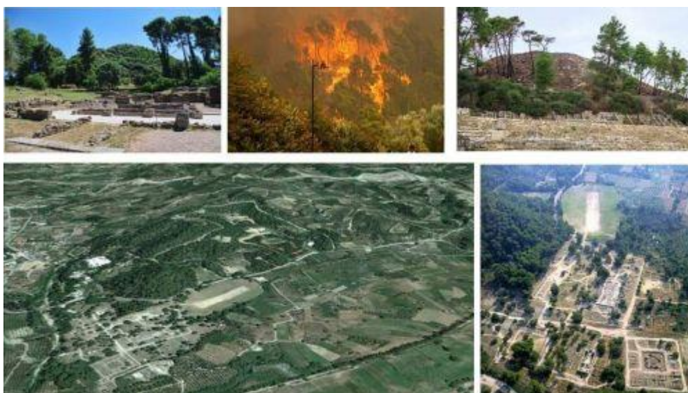
Figure 1: The archaeological site of Olympia is surrounded by extensive forestry, thus always at risk from fires that are often influenced by climate change in terms of occurrence and dispersion.

According to the results obtained so far from all the above research programmes, as well as the data collected by governmental and scientific research institutions and organisations, the main climate change factors and impacts for the Greek monuments could be summarised as follows: