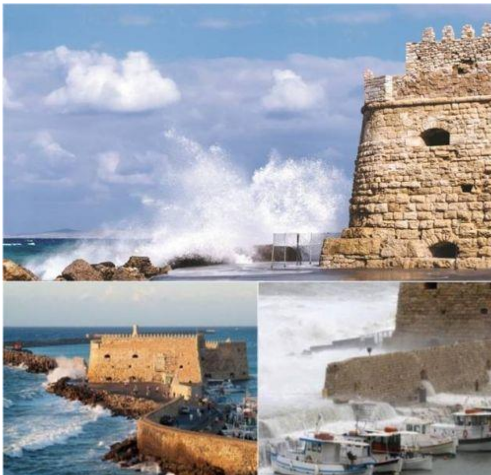
Figure 2: In Crete, rising sea levels and intense waves threaten the sea fortress of Koules in Heraklion.