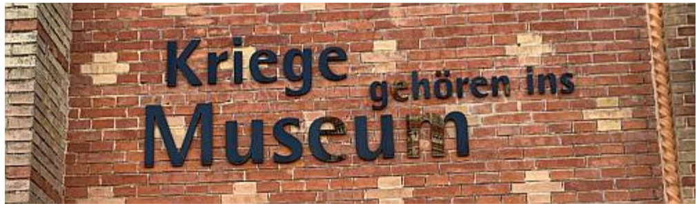
Figure 1: Text on the wall of the military museum in Vienna: wars belong in the museum

I experienced a Dutch example of this phenomenon myself on 8 December 2015. On that date, the Senate of the Dutch Parliament dealt with two bills: a new Heritage Act and a new Nature Conservation Act. The two legislative processes had run completely in parallel, without any common points being identified or coordination being considered at any time. In addition, both national laws were needed for the implementation of several international treaties. Apparently, this fact created no need for coordination whatsoever. Although both domains are seemingly inextricably linked, there is surprisingly little overlap through policy and regulation. It seems that there is profit to be made at both national and international level if these worlds are kept apart from each other.