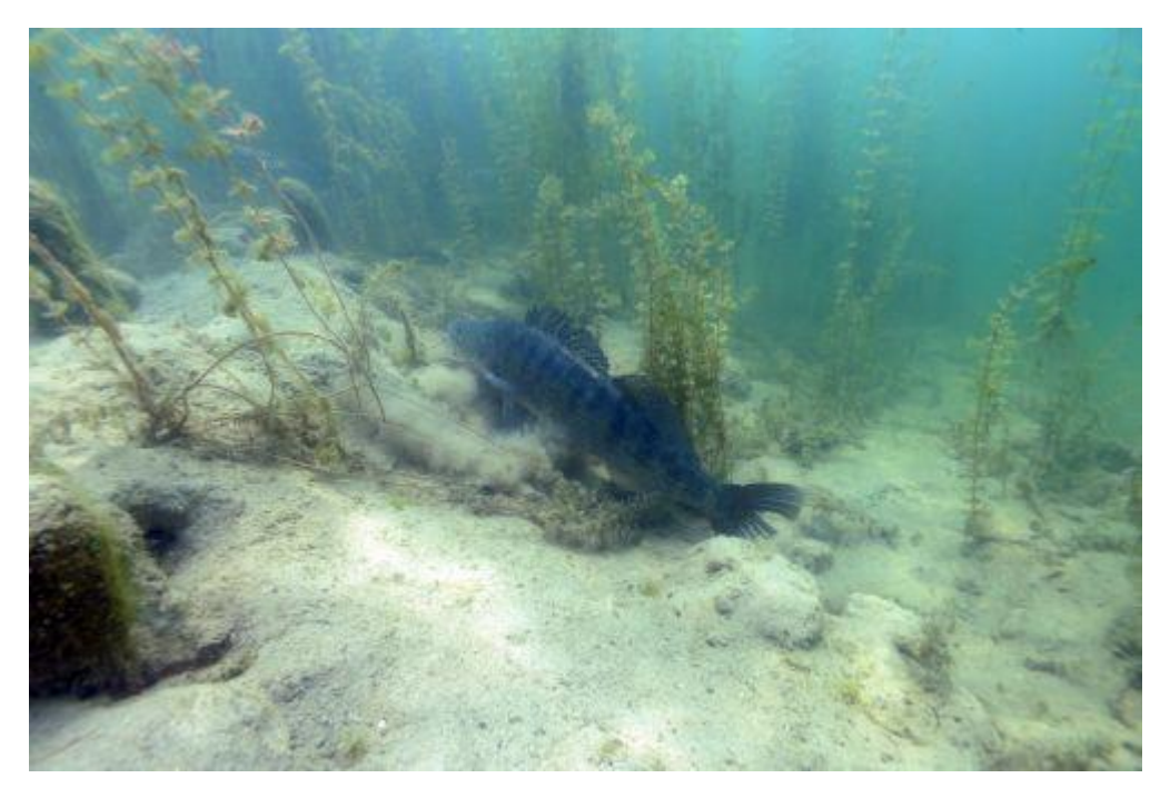
Figure 2: Pikeperches at the UNESCO World Heritage site of Keutschacher See in Carinthia/Austria

refuge between the piles in the middle of the lake (Figure 2) (Poppenwimmer 2020; Billaud 2021). However, owing to the legal situation - the water is privately owned and the economic importance and popularity of the pikeperch as an edible fish among sport anglers, the originally non-native pikeperch cannot simply be removed. Also in Keutschach, the native European noble crayfish ( Astacus astacus ) had made a home in the lake dwellings until recently (Petutschnig 2001). There are numerous crayfish dens and corridors in the settlement area which are eroding the site in places and above all creating leverage points for erosion. However, these constructions seem to have been abandoned as a result of crab plague. Fortunately, the disease-resistant invasive signal crayfish ( Pacifastacus leniusculus ) and spinycheeked crayfish ( Faxonius limosus ) have not yet been able to establish themselves here. These two species are a serious threat to the lake dwellings in France and are widespread in Lake Constance (Hagmann and Köninger 2022).