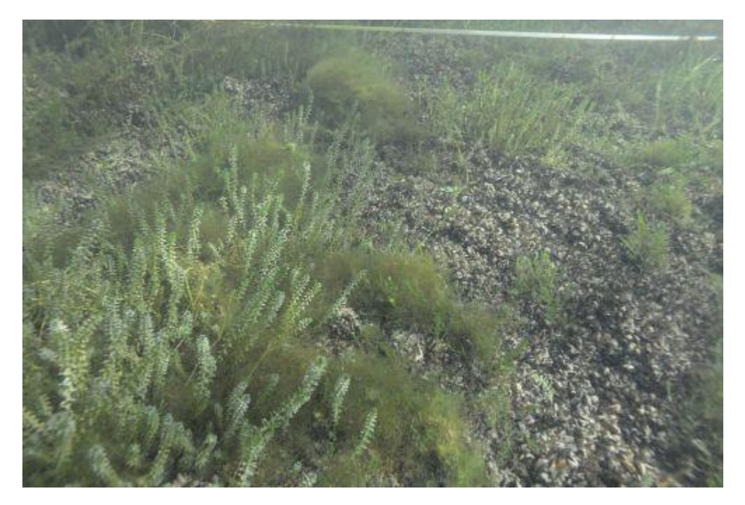
Figure 3: Dense coverage of the lake bottom with Zebra Mussels (Dreissena polymorpha) at the Iron Age site of Traunkirchen in Upper Austria

Neophytes are also spreading in the circum-Alpine waters, and the coverage of sites with aquatic macrophytes can have different effects. On the one hand, there is the risk of greater destruction in the upper layers owing to a stronger root system within the lake sediments. On the other hand, there are also positive effects, as less sediment is removed in the calm area of algal carpets, and plants can even act as sediment traps.